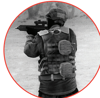
Trijicon Electro Optics 12µm, 640x480 @ 60Hz