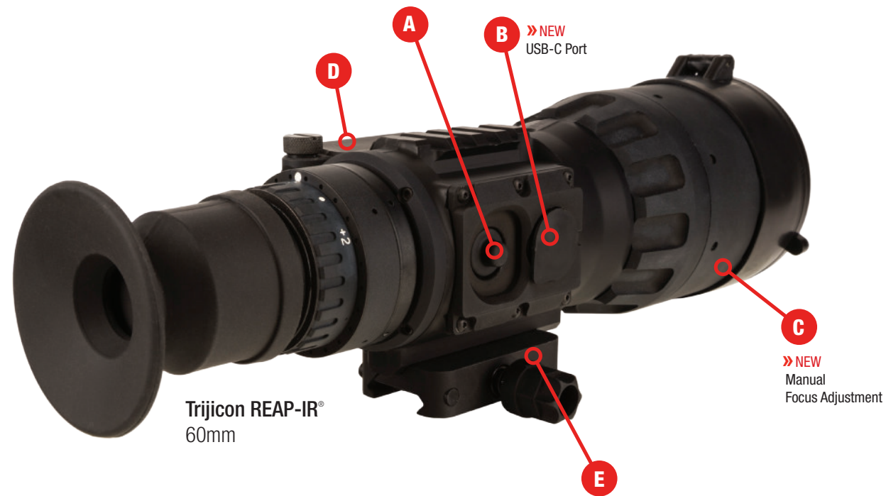
Trijicon REAP-IR® 60mm